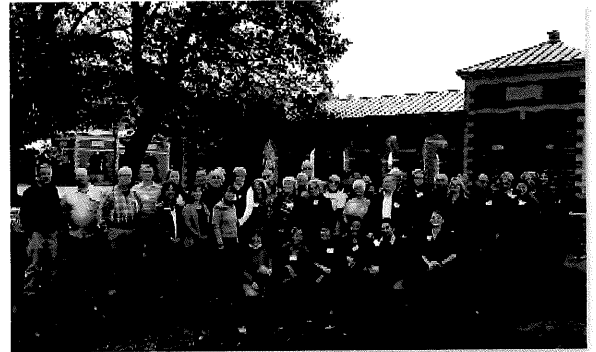
Friends groups like those at this Saratoga/Capital Region Friends Gathering contribute significantly to the stewardship of the state parks system.

Often, these groups are comprised of a relatively small number of dedicated individuals—in most cases, volunteers—who accomplish herculean tasks: they raise private funds for capital projects; perform maintenance tasks; provide educational programming; and promote public use through hosting special events.