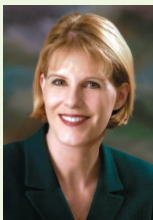
Senator Catharine M. Young, Chair

The NYS Legislative Commission on Rural Resources is a joint bi-partisan office of the State Legislature.