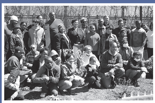
Addesleigh Park Clean Up

Meeting with the residents of Laurelton during a town hall meeting.