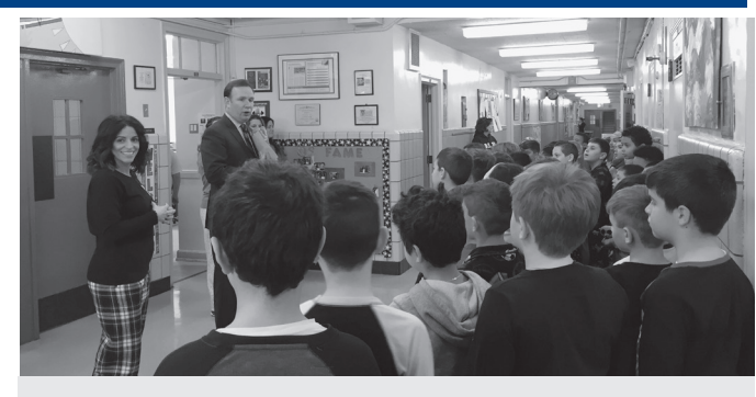
Assemblyman Cusick speaks with students from PS 35.

Community Education Council 31 is a group of parents & education advocates who meet on the first Monday of each month during the school year. They discuss topical issues on Staten Island education. The Council serves as a liaison to the Department of Education and represents the entire borough of Staten Island. Their office is located at the Petrides Educational Complex, 715 Ocean Terrace, Staten Island, NY 10301. You may reach the Council by phone at 718-420-5746, by fax at 718-420-5745 and via e-mail at CEC31 @schools. nyc.gov. Their website is http://www.cec31.org/meeting-schedule/.