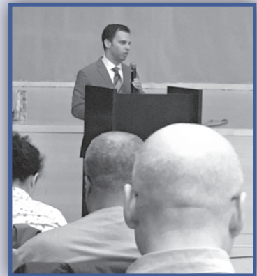
Assemblymember Quart discusses local issues and the state budget at a Community Board meeting.

At the city level, I am excited to see the City Council consider a proposal to provide sanitary products in public schools at no cost—like the elimination of the tampon tax, this move will help to make sure that young women are not unfairly charged for products that they have no choice but to use. A pilot program at a high school in Queens to provide these products at no cost proved such a success that it is being expanded to 25 other schools, ensuring that low-income students can focus on their studies, and not on paying for sanitary products. For too long, the stigma surrounding this aspect of women's health have prevented lawmakers from discussing this issue—let's continue working together to make sure that all the health concerns of all New Yorkers are treated fairly.