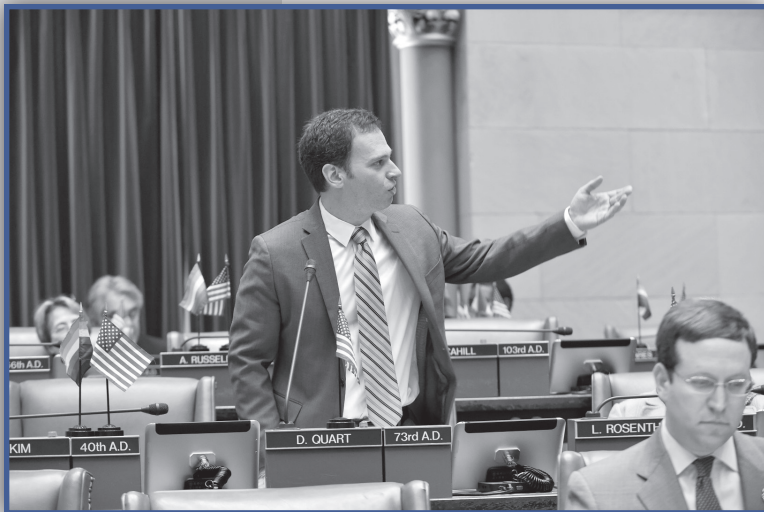
Assemblymember Quart fighting for constituents of District 73 on the floor of the Assembly Chamber.

Raising the minimum wage will also help to reduce the inequality between middle-income and low-income households. In New York City, the series of increases will begin at the end of 2016, first raising the wage for employees at large businesses to $11 an hour and employees at small businesses to $10.50 an hour. The wage increase will continue gradually, giving business owners ample time to adjust to the new minimum wage. All New Yorkers deserve a fair wage for their hard work, and this minimum wage increase helps to provide that.