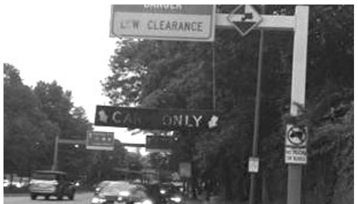
"Boston-style" height barrier.

With trucks and wrong-way drivers making our parkways dangerous, Assemblyman Abinanti is insisting that the State DOT act. Abinanti wants an independent review panel to redesign parkway entrances/exits and add clear signage. Abinanti also wants "Boston-style" height barriers installed across parkway entrances most frequently used by oversized trucks.