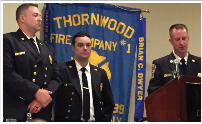
Thornwood Fire Company #1.