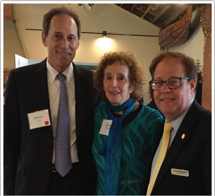
Federated Conservationists of Westchester.

In addition, the budget increased the appropriation to the Environmental Protection Fund to $300 million, which included several million dollars dedicated to clean water projects.