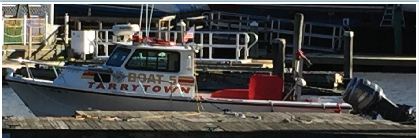
Tarrytown's twenty-year-old fireboat will be replaced by a larger modern-equipped fireboat.

The Tarrytown Fire Department responds to boating accidents, construction accidents and suicides from the bridge. The marine unit was the first to respond to the March 12th 2016 tugboat tragedy near the old Tappan Zee Bridge.