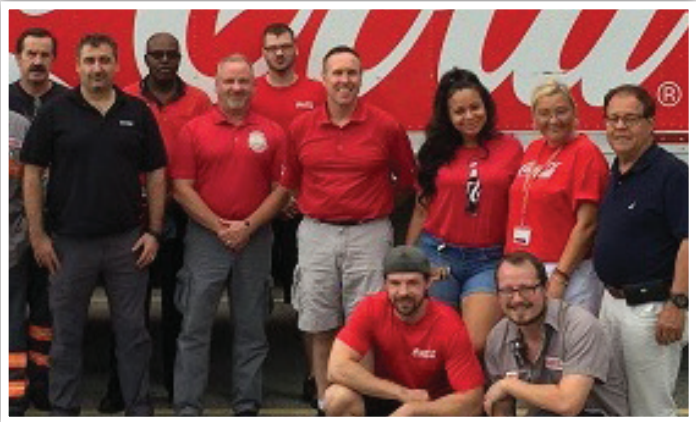
Workers at a local bottling plant.