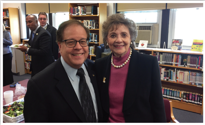
Matilda Cuomo's NYS mentoring program in Elmsford Schools.