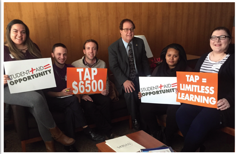
Meeting in Albany with Pace students.

HEALTH & HUMAN SERVICES “Direct care workers” who provide the hands-on care for so many seniors and others with disabilities have not had a raise in state-funded programs for several years. The budget included $55 million to give direct care workers a 6.5% pay raise over the next two years. Hopefully, the raise will encourage experienced caregivers to remain in their jobs and encourage others to join the field which has seen a decrease in its workforce.