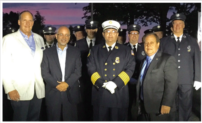
Dobbs Ferry Fire Department Inspection.