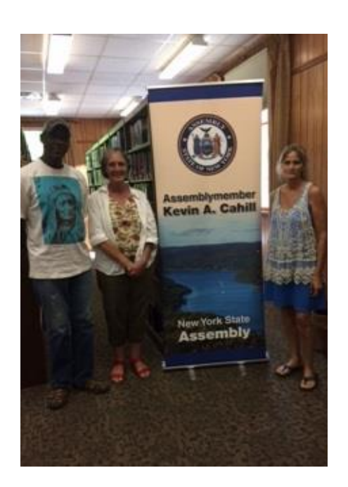
Residents of Olivebridge meet with our staff.

We always welcome your voice, your opinions and your needs and invite you to stop by, even just to say hello and introduce yourself.