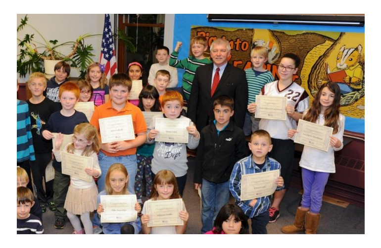
As school ends and summer begins, let's make sure our kids keep reading and stay on the path to a brighter future.

Summer has arrived and so has the fun! It's not only a time for children to play outside until the sun goes down, but also an opportunity for their imaginations to run wild as they dive into new, exciting books. That's why, in partnership with New York State libraries, I am inviting children to participate in the Assembly's Annual Summer Reading and Exercise Challenge.