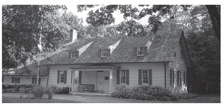
Madam Brett Homestead