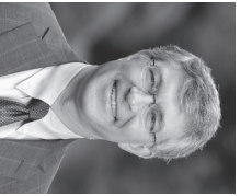
Assemblymember Phil Steck