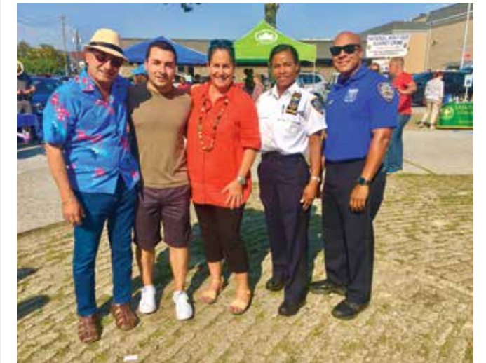
Assemblywoman Pheffer Amato with the Commanding Officer from the 100th Precinct on National Night out Against Crime 2017. The 23rd Assembly District encompasses the 100th, 101, and 106th Precincts.