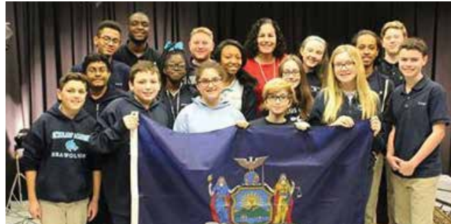
Assemblywoman Pheffer Amato with local students who participate in student government at Scholars' Academy.

Investing in our Children's Education. The 2017-18 state budget increases education aid by $1 billion for a total of $25.7 billion, a 4.1 percent increase from last year's budget, reaffirming the Assembly Majority's unrelenting commitment to putting every student on their path to success. The budget also increases Foundation Aid by $700 million for a total of $17.2 billion.