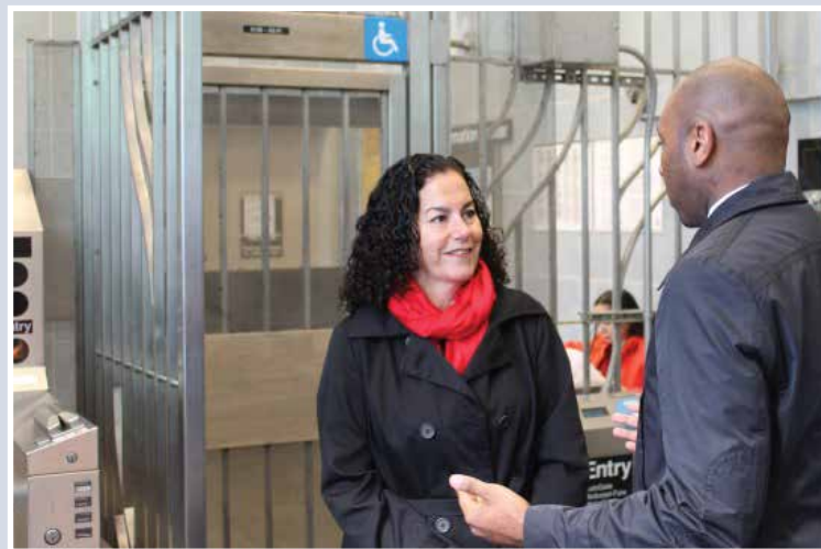
Transit Options for South Queens: Reactivating the Rockaway Beach Rail Line (RBRL), also known as Queens Rail, may be the best and most permanent fix for our transit issues.

Making College Affordable. The state budget provides funding to establish the Excelsior Scholarship to make SUNY schools tuition-free for New Yorkers who earn less than $100,000 annually. Students who attend a private college in New York and earn less than $100,000 annually would also be eligible for a scholarship award of $6,000. After year one the average household income increases to $125,000.