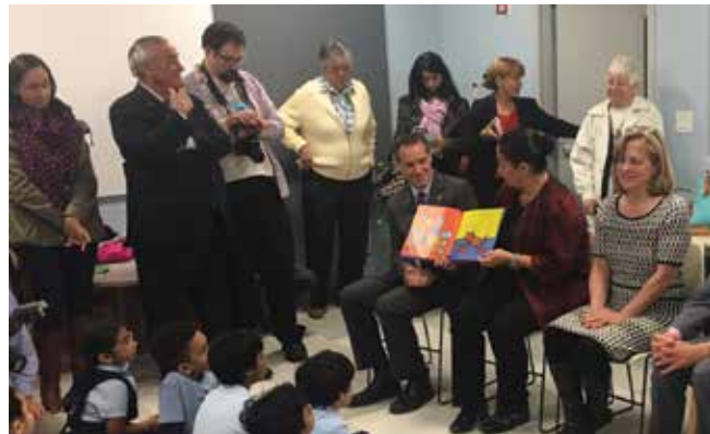
Ozone Park Library Reopening this past year.

Supporting our Public Libraries. This year's budget restores aid to public libraries by $4 million dollars to ensure they can continue to provide vital services and resources to residents.