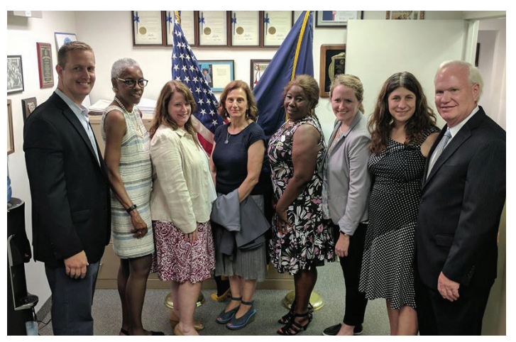
Assemblyman Hevesi, Foster Care advocates, and Senator Tony Avella attend a press conference announcing the passage of KinGAP legislation