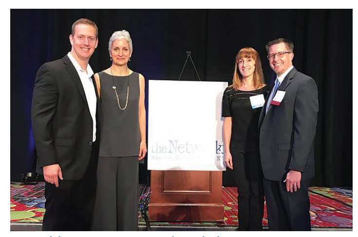
Assemblyman Hevesi stands with the Supportive Housing Network of New York in the fight to secure additional supportive housing units in New York