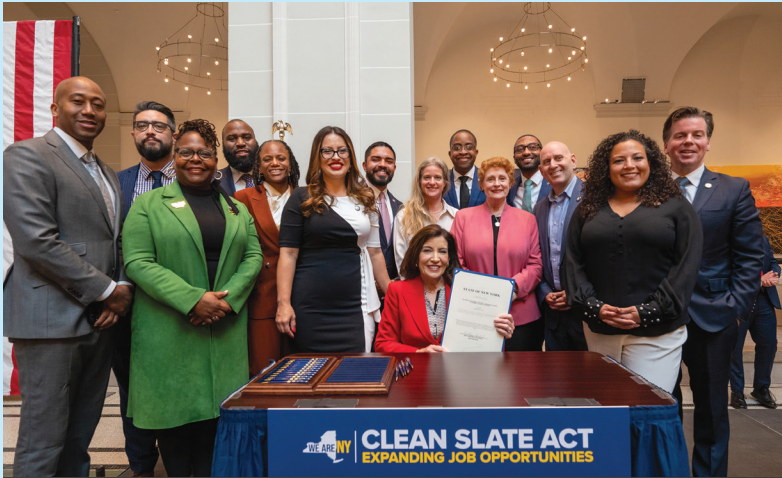
Assemblymember Carroll with Governor Hochul and bill sponsors at the bill signing of the Clean Slate Act.