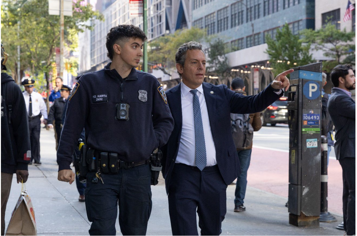
Walking West 42nd Street with the NYPD during a public safety walkthrough organized by my office.