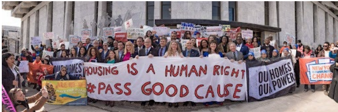
Rallying in Albany with hundreds of tenants and colleagues to pass Good Cause Eviction.

I have fought hard to pass Good Cause Eviction legislation which will ban the monstrous rent increases so many of us have seen in recent years. Keeping tenants stable in their homes means stronger communities, healthy families and less homelessness.