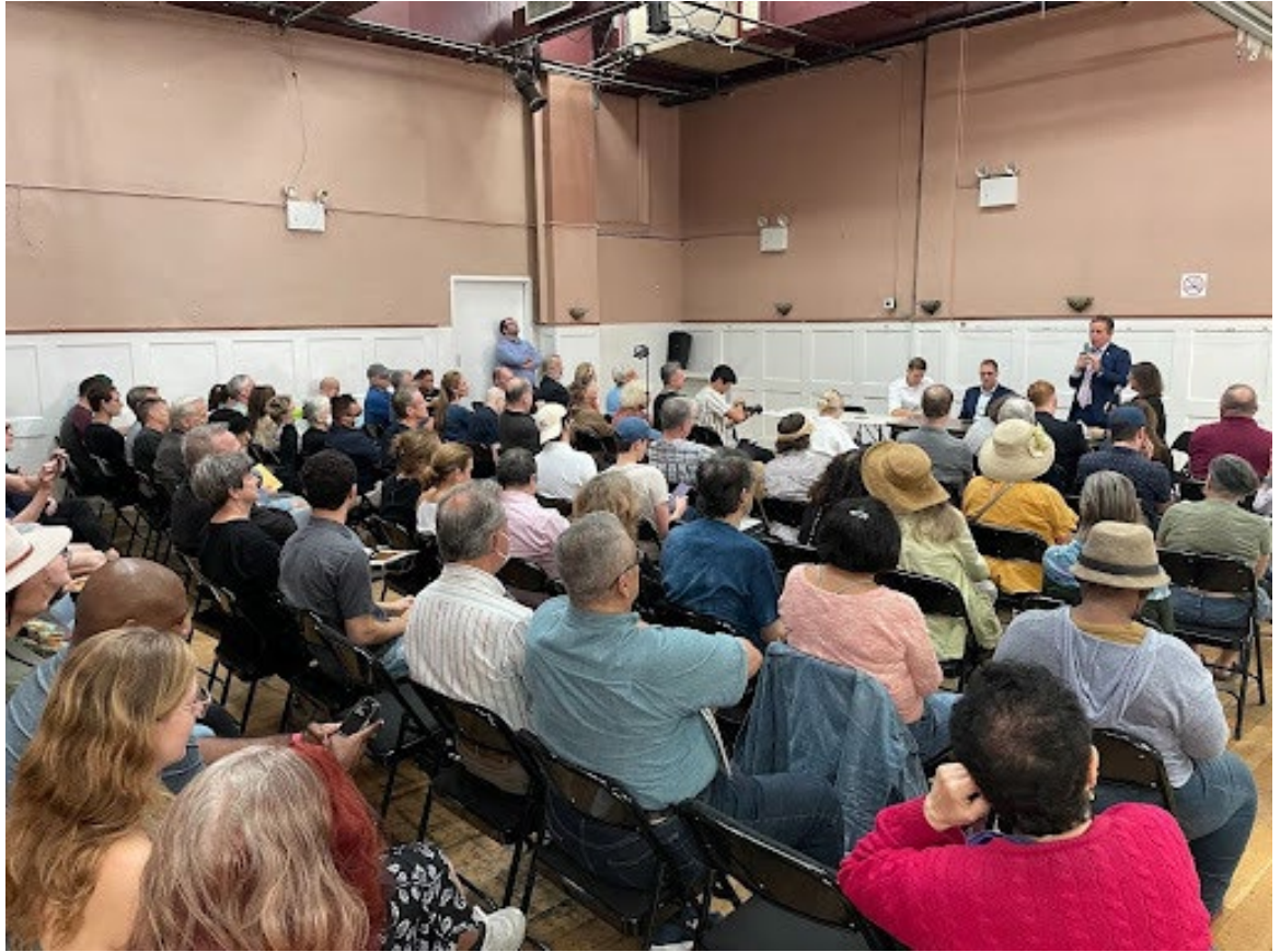
I held my first town hall meeting at Hartley House in Hell's Kitchen with over one hundred of our neighbors joining to discuss a wide range of issues.