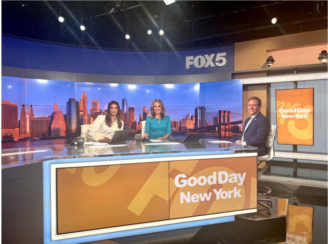
I joined Good Day New York to discuss the Commercial E-Bike Licensing Act, and making our streets safer for everyone!