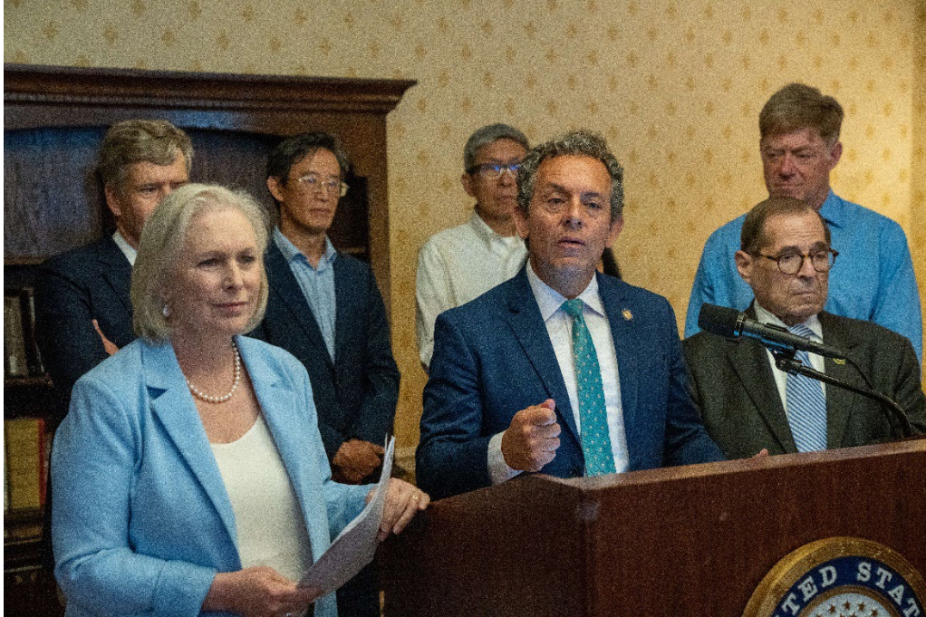
Speaking on the need for greater funding for people with severe mental illnesses at Fountain House in Hell's Kitchen with Senator Kirsten Gillibrand, Congressman Jerry Nadler and State Senator Brad Hoylman-Sigal.

problem by creating a new package of services under Medicaid specifically targeted to individuals living with SMI, setting a national standard for SMI care, and incentivizing states to provide intensive community-based services to treat SMI.