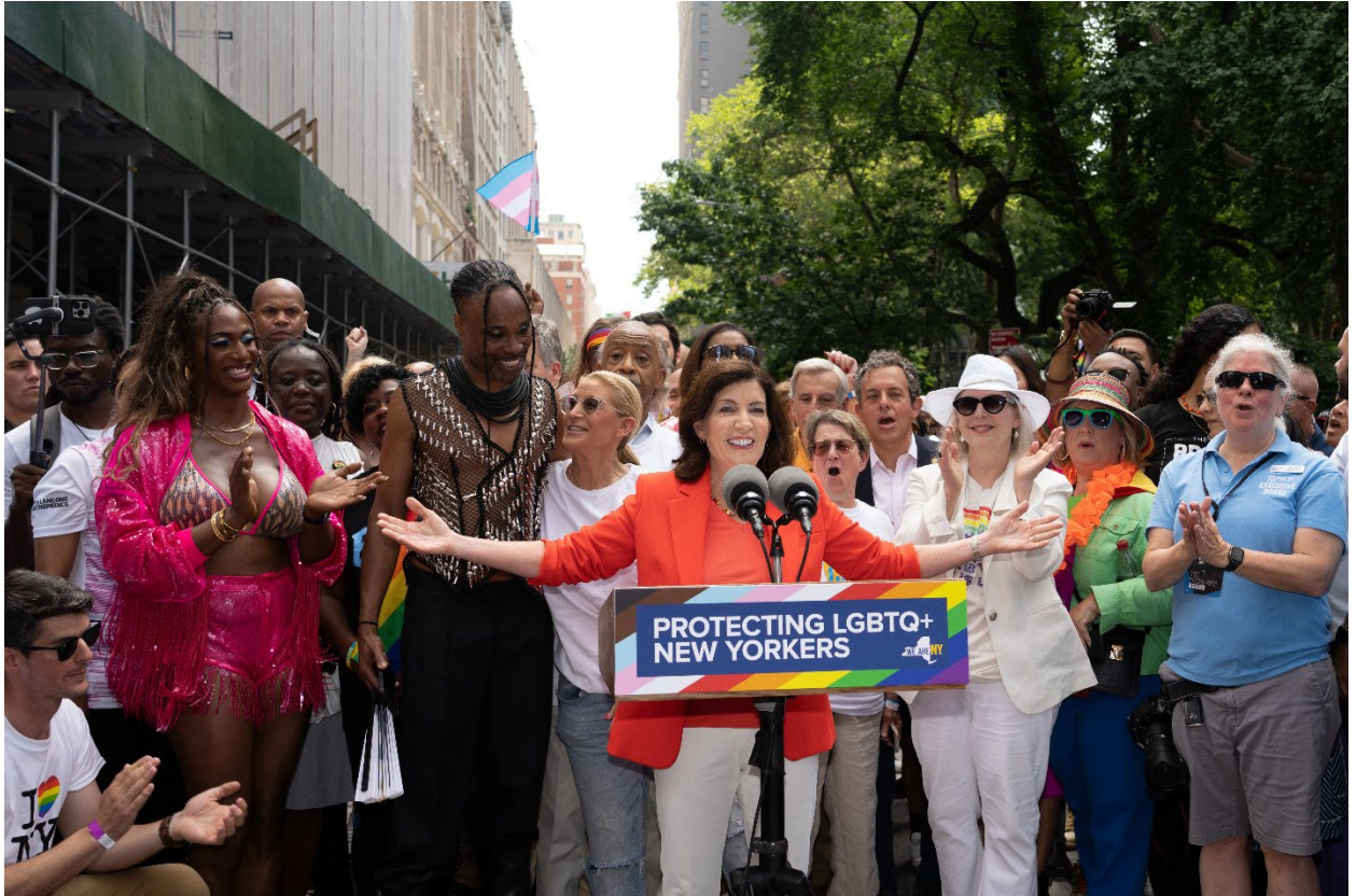
Governor Hochul after signing my legislation removing homophobic language from state law as well as the Transgender Safe Haven Act!