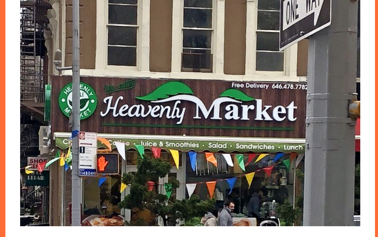
Submit your favorite small business here to be featured in our next e-newsletter!