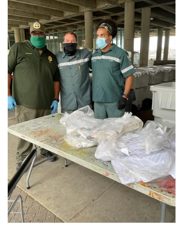
Department of Sanitation team ready to shred!