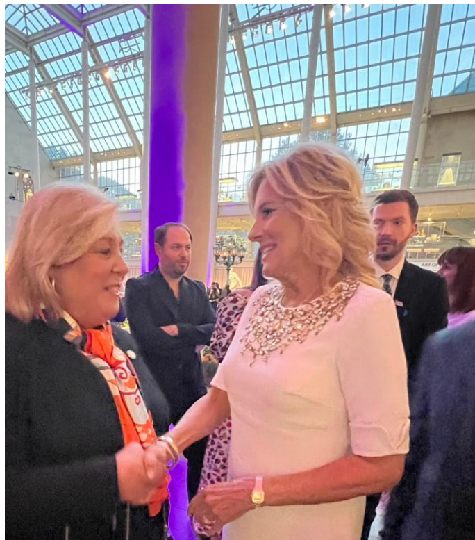
Assembly Member Seawright and First Lady Dr. Jill Biden at a reception for the United Nations General Assembly at the Metropolitan Museum of Art.