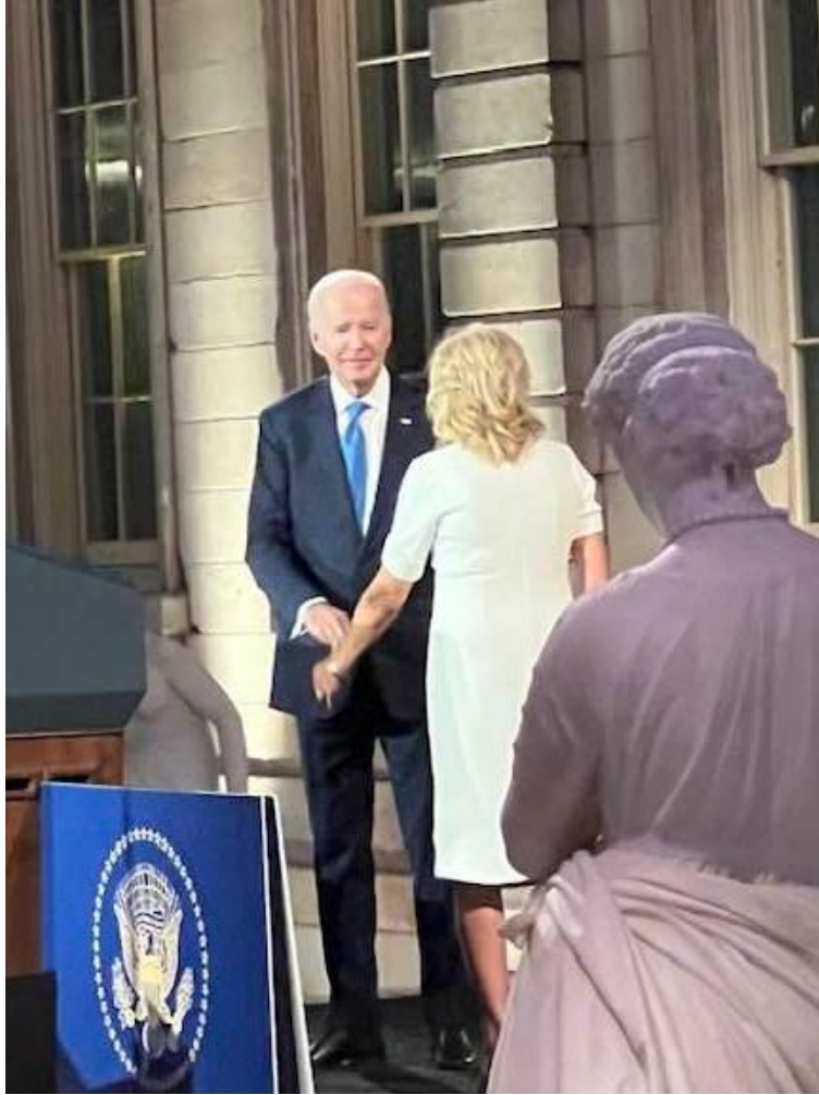
President Biden and the First Lady take the stage at the Met to address world leaders during UN General Assembly week.