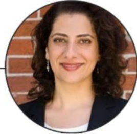
Lawyer and Policymaker, Stanford University (Former SVP at NYCEDC)