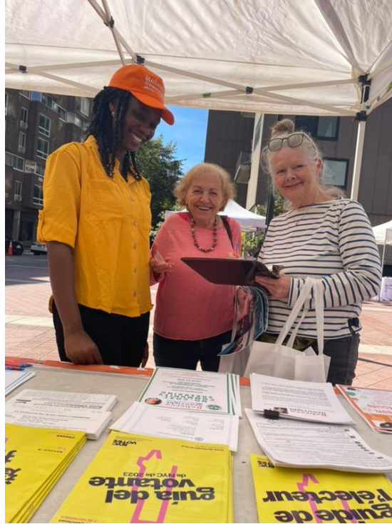
Roosevelt Islanders browsing the information table at the Carter Burden Senior Fair this Thursday.