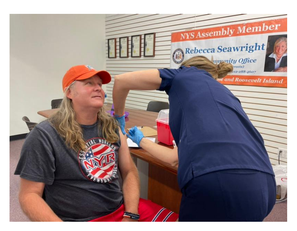
A neighbor received his flu shot at the no-cost seasonal flu shot clinic in our district office. Over 50 constituents received their shot of protection!