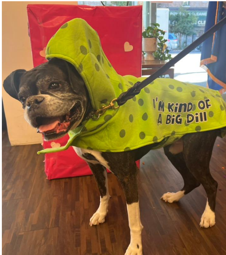
Lola the dog dressed as a dill pickle.