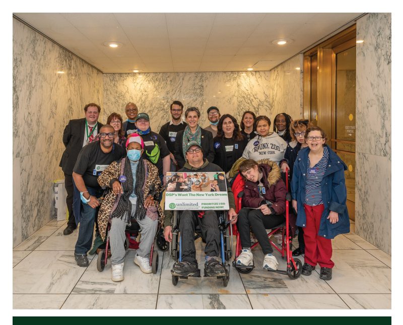
Meeting with CP Unlimited during their Advocacy Day in Albany.