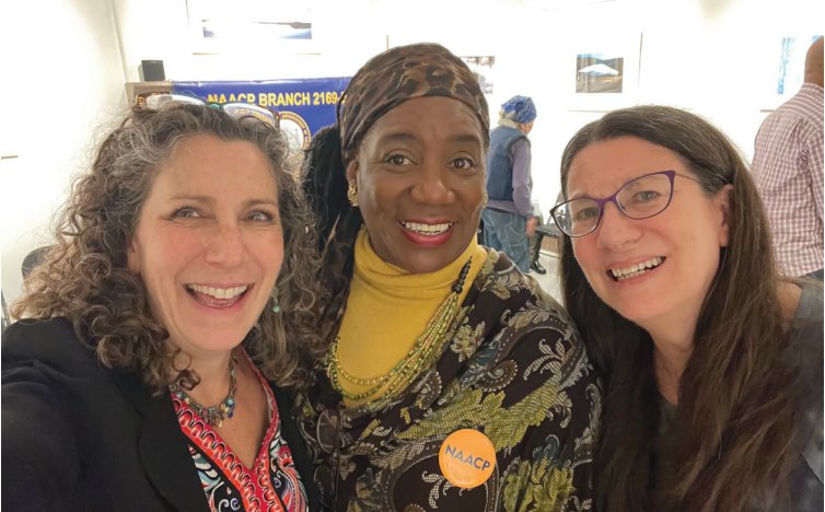
With members of the Ossining NAACP at Bethany Arts Center.