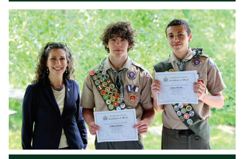
Presenting Certificates of Merit to two of our Yorktown Eagle Scouts.