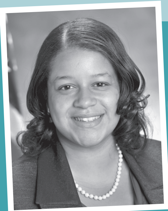
— Assemblywoman Michaelle Solages

“I’m working to make the 22 nd Assembly District a better place for you and your family.”