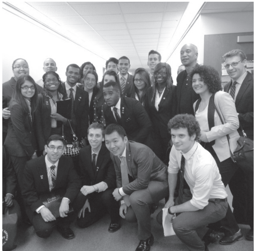
Meet and Greet with Baruch College—The City University of New York (CUNY) students.

Here's how the challenge works: Mark a calendar for each day in August that your child reads with you, someone else or alone. Once you have marked off 25 days or more, please contact my office and I will award your child with a New York State Excellence in Reading Certificate. Thank you and happy reading!