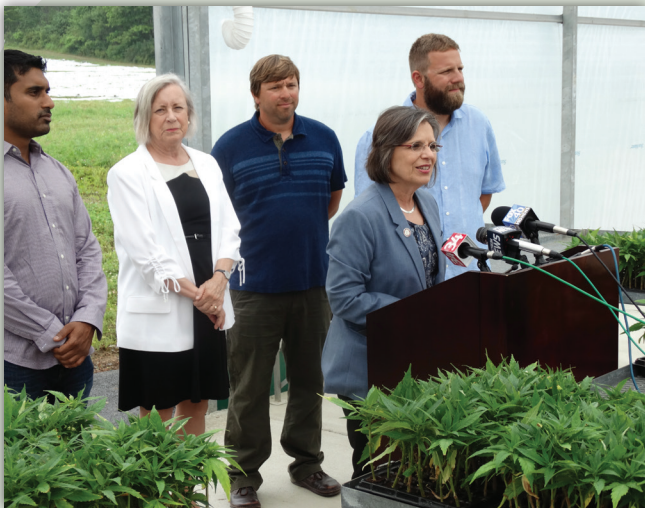
Announcing a partnership between Nanticoke Gardens, Binghamton University, and Southern Tier Hemp to grow hemp for BU's research project.