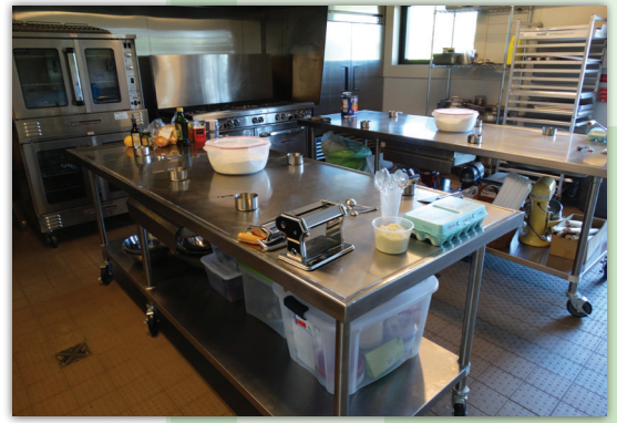
The commercial kitchen at the Broome County Regional Farmers Market.