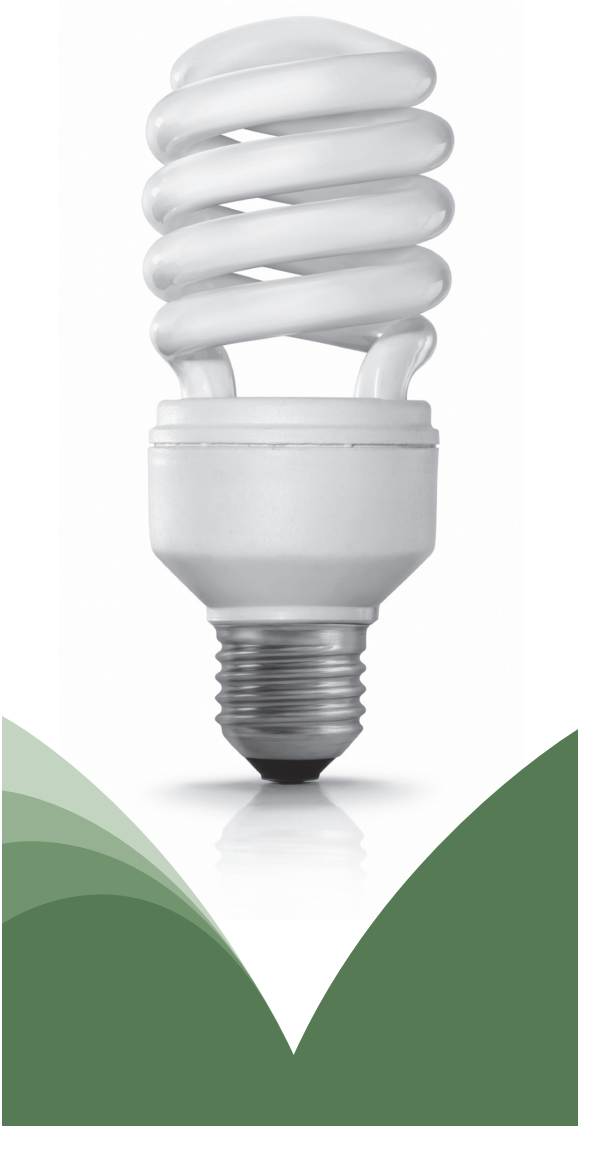
COMPLIMENTS OF ASSEMBLYMEMBER HARRY B. BRONSON