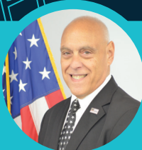
Assemblyman Joe DeStefano

1. A2488 | 2. A8064 | 3. A02494 | 4. A06605 | 5. A03937