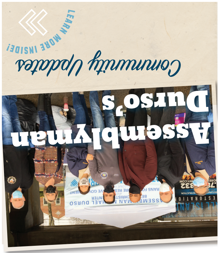
New York State Assembly • Albany, NY 12248

PRSR STD. US Postage PAID Albany, NY Permit No. 75