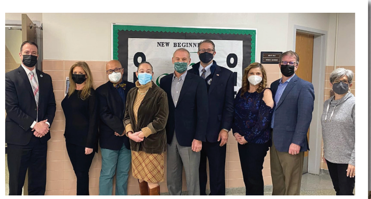
With members of the Harborfields Board of Education to hear and discuss community concerns at the annual legislative breakfast.