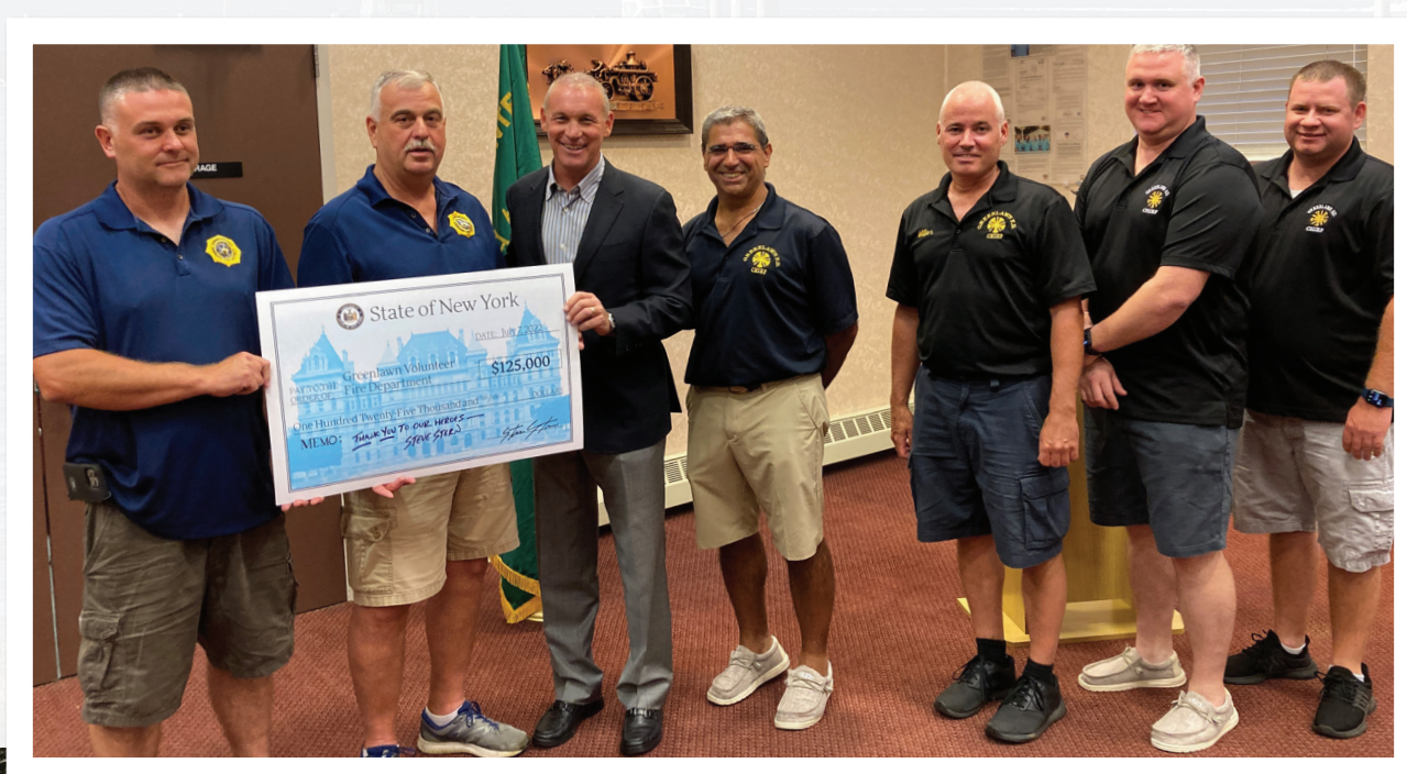
Presented vital funding to our volunteer firefighters - the heroes of our community.