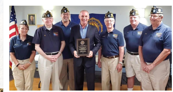
Proud to be honored by the Greenlawn American Legion Post #1244 for my strong support of our veterans.