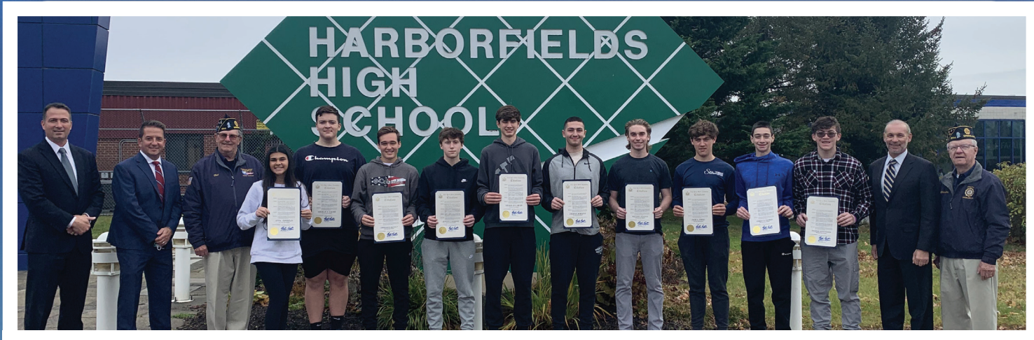
Proud to support the Boys' and Girls' State Program and our leaders of tomorrow.