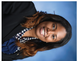
Assemblywoman Kimberly Jean-Pierre