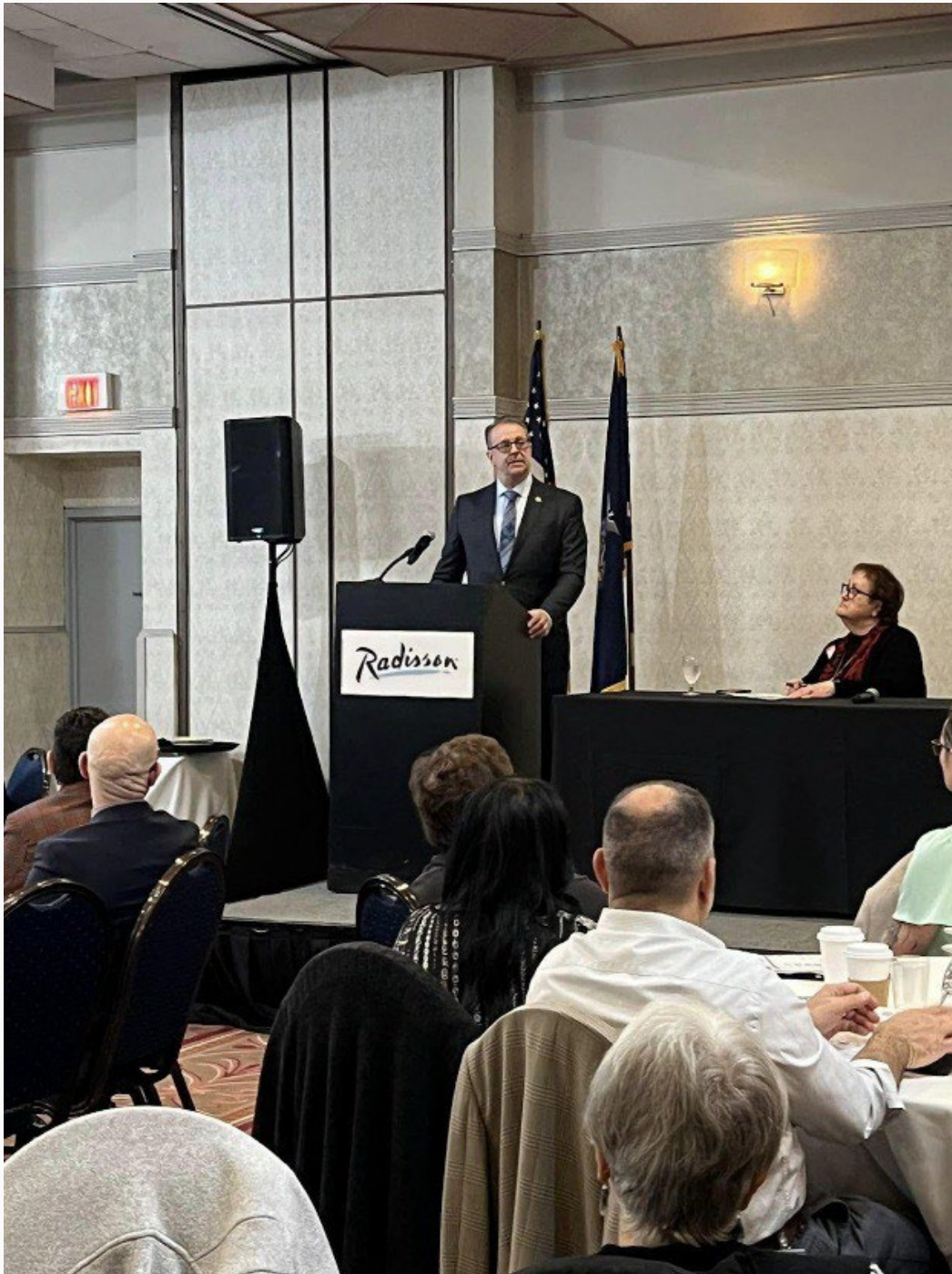
3rd Annual Co-Occurring Disorder Conference