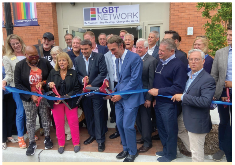
Assemblymember Lavine attends the historic ribbon-cutting and dedication for the brand-new LGBT Network affordable senior housing and community center in Bay Shore. The complex is the first of its kind in suburban America. The 75-unit and 8,000 square foot complex is located at 34 Park Avenue in Bay Shore.