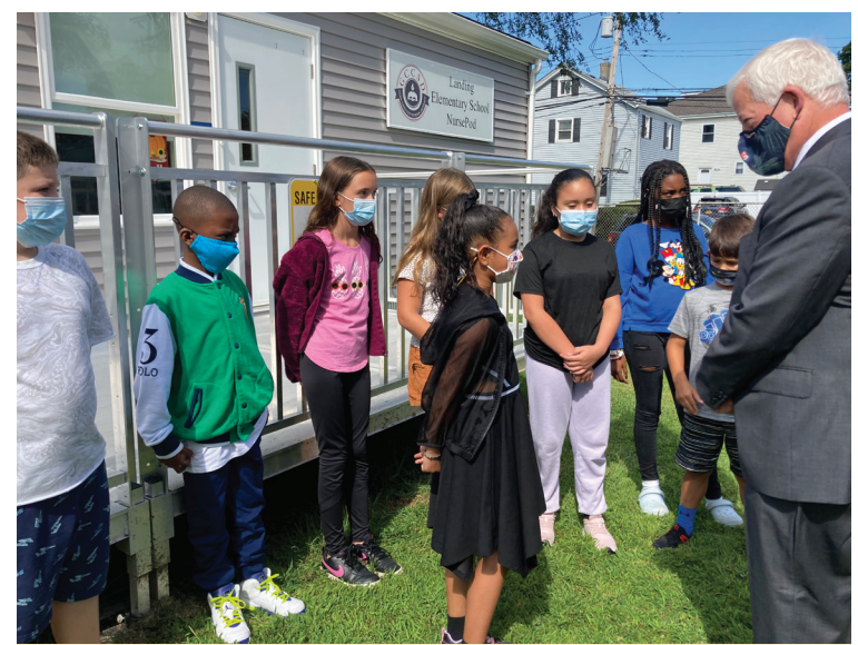
Assemblymember Lavine tours the nurse pod at Glen Cove's Landing Elementary School with some extraordinary students who were curious and engaging. The use of the pods comes at a critical time when school is in session and children can safely isolate. Lavine is pleased to have provided the state funding for the pods at Landing, Gribbin and Connolly Schools, believing our first obligation is to protect our precious children.