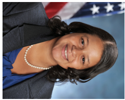
Assemblywoman Michaele Solages