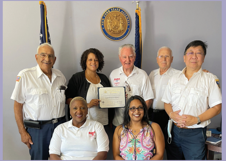
Valley Stream Civilian Patrol is looking for new members to serve and protect the community. Become a volunteer and be the watchful eye for Valley Stream. Call (516)-823-9088 or visit valleystreamcivilianpatrol.org for more information.