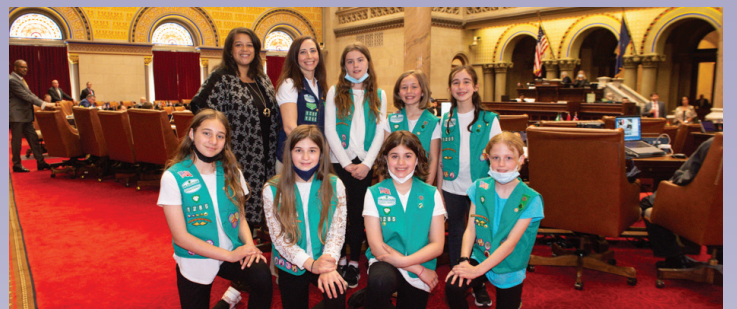
The Floral Park/Bellerose Girl Scout Troop 1285 collaborated with Assembly-member Solages to draft and pass a resolution to proclaim May 3, 2022, as Juvenile Idiopathic Arthritis Awareness Day in the State of New York.