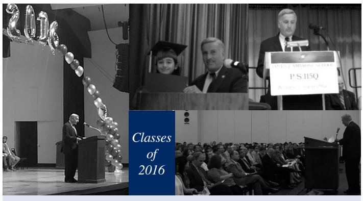
Congratulating the 2016 Graduating Classes of PS/IS 178 Holliswood, PS 115 Glen Oaks, Richmond Hill HS, and Summit School