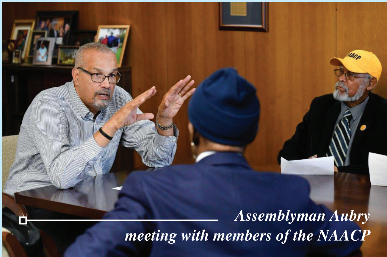
Assemblyman Aubry meeting with members of the NAACP

A s our young people are getting ready to graduate from high school they can now benefit (as can all eligible New Yorkers) from the new NYS voter registrations laws: