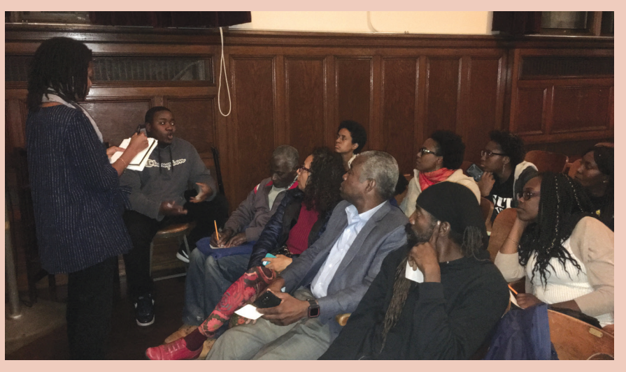
Participants at the Little Haiti Community Forum broke out into groups to discuss ideas based on topics such as development, housing, and arts and culture.

New York State Assembly • Albany, New York 12248