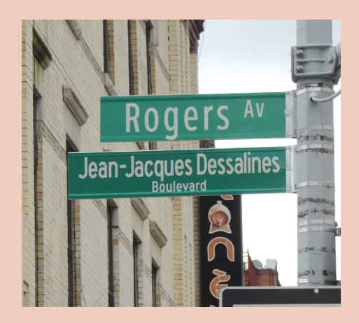
Little Haiti Cultural and Business District was officially established in June after City Council adopted a resolution and presented a proclamation announcing its establishment. The streets Rogers Avenue and Nostrand Avenue were co-named Jean-Jacques Dessalines Boulevard and Toussaint L'ouverture Boulevard, respectively.