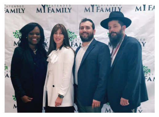
Assemblymember Bichotte joins My Extended Family Inc. as they celebrate Chanukah.