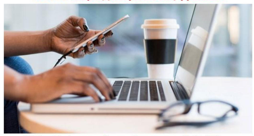
NHS Brooklyn is a nonprofit counseling agency certified by HUD. www.nhsbrooklyn.org

NHS Brooklyn is hosting a webinar on how to avoid foreclosure. The event information and registration page is below.