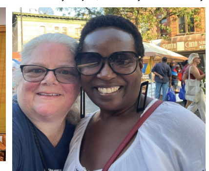
The office of Assemblymember Rodneyse Bichotte Hermelyn attends Flatbush Development Corp's (FDC's) Flatbush Frolic.