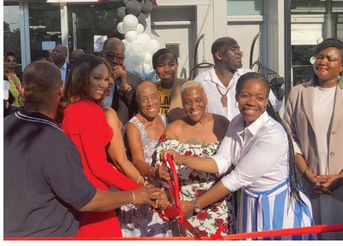
The internationally known Allan's Bakery hold their ribbon cutting for the expansion to Allan's Bakery Bar & Café.