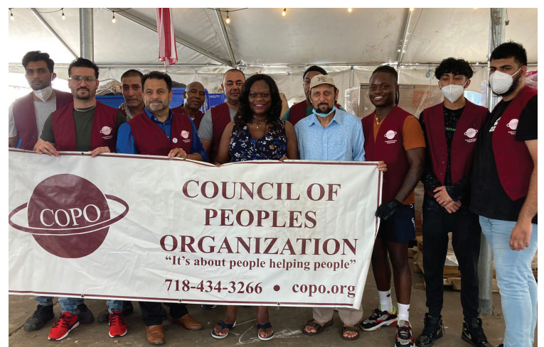
Assemblymember Rodneyse Bichotte Hermelyn attends COPO's Pakistan Flood Relief drive after the devastating flood in Pakistan.