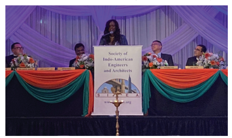
Assemblymember Rodneyse Bichotte Hermelyn attends the Society of Indo-American Engineers and Architects (SIAEA) 40th annual gala.