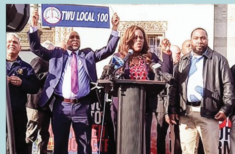
Assemblymember Bichotte Hermelyn rallies with TWU Local 100 members (who run NYC's public transit ) to demand safer conditions for transit workers following a dramatic spike in assaults and harassment of workers.