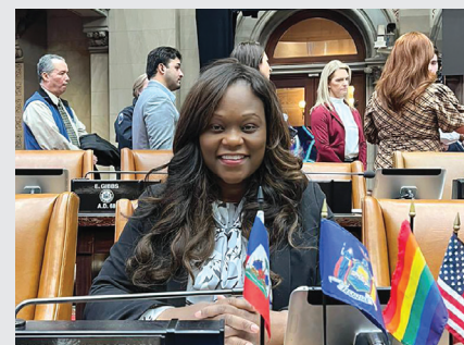
Assemblymember Bichotte Hermelyn at her seat in the New York State Assembly's Chamber.

Link: https://www.nyc.gov/office-of-the-mayor/news/876-24/mayor-adams-axe-tax-the-working-class-bold-proposal-eliminate-new-york-city/#0