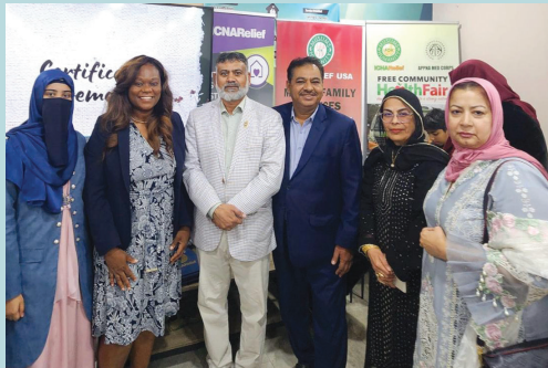
Assemblymember Bichotte Hermelyn honoring volunteers at ICNA Relief USA's Volunteer Appreciation Day celebration.