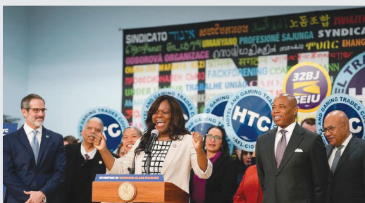
Assemblymember Bichotte Hermelyn at the "Axe the Tax" press conference, alongside Mayor Eric Adams, Union Leaders, and Officials from the Mayor's Office.

Assemblymember Bichotte Hermelyn is already at work: announcing plans to sponsor legislation that would enact Mayor Eric Adams' "Axe the Tax for the Working Class" plan. The proposal would bring significant tax relief to working-class families and return over $63 million to more than 582,000 New Yorkers.