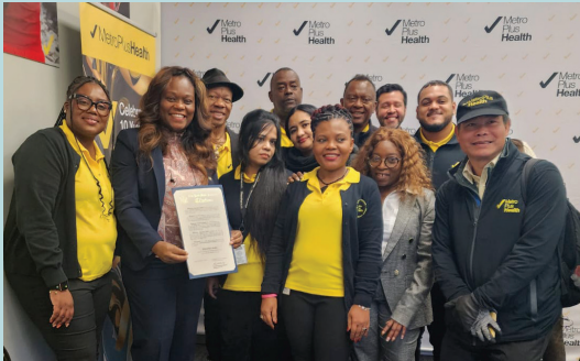
Celebrating MetroPlus Health's Brooklyn branch providing affordable health insurance for 10 years.