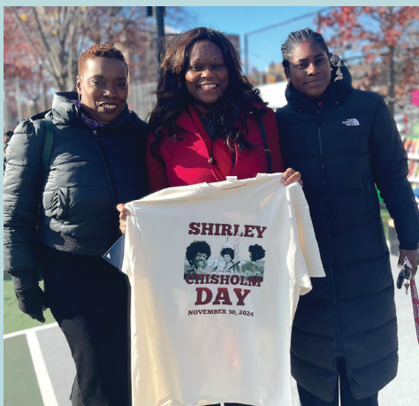
Honoring the late Rep. Shirley Chisholm's legacy on Shirley Chisholm Day, for the 100th anniversary of her birth date. This marked the 1st "Official" Shirley Chisholm Day thanks to a resolution passed in the New York City Council.