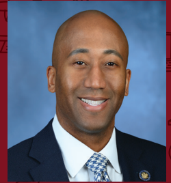
Assemblymember Clyde Vanel