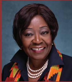
Assemblymember Crystal Peoples-Stokes