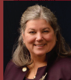
Assemblymember Carrie Woerner