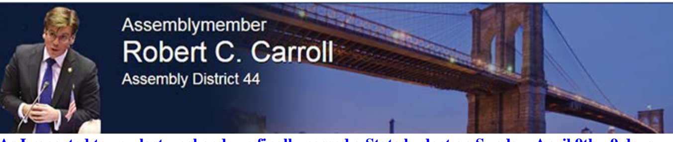
As I reported to you last weekend, we finally passed a State budget on Sunday, April 9th - 9 days past due. The legislature is now on recess for the Passover and Easter Holidays and will return on Monday, April 24th.

While we did pass a budget, there could be more changes based on the Federal government's budget later this year. There is a plan in place in this budget that if the federal government cuts $850 million or more of funding to New York State, the Governor's division of budget will develop a plan for spending cuts that will automatically go into effect in 90 days, unless the Assembly and Senate provide an alternative plan.