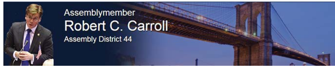
March 23, 2018