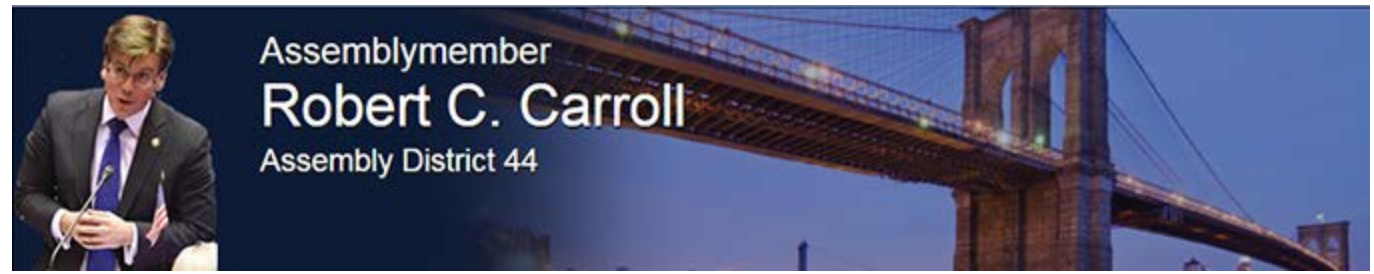
June 8, 2018