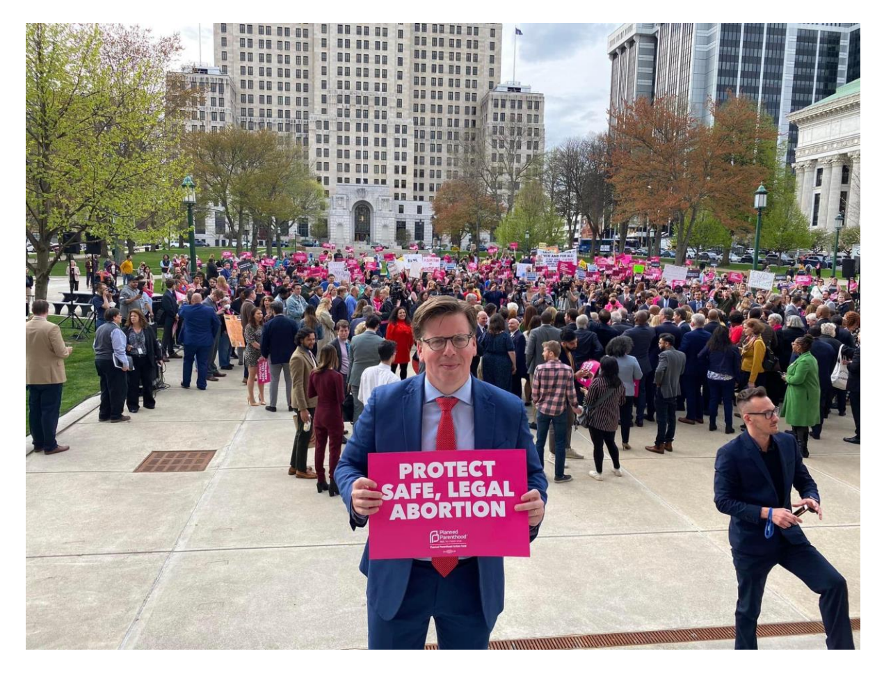
I promise to continue to fight to protect the constitutional rights of all New Yorkers and guarantee that women have access to safe and affordable abortion care.

In 2019, I was proud to cosponsor and pass the Reproductive Health Act, which codified Roe v. Wade protections into State law. There are now several new pieces of legislation that I support, which will strengthen abortion rights for New Yorkers as well as residents of other states facing abortion restrictions. Assembly bills <u>A.9627</u>, <u>A.9613</u>, and <u>A.9615</u> protect New York's abortion providers from interference from law-enforcement from other states, while Assembly bills <u>A.1926</u> and <u>A.10148</u> would establish funds to support abortion providers and non-profits providing abortion related care. I also strongly support a proposal by State Senator Liz Krueger <u>S.8797</u> to include an Equal Rights Amendment in our State Constitution. At a time when hard fought for rights are under assault at the federal level, we need a New York State Constitution that contains a comprehensive and enforceable equal rights provision, to realize the promise of legal equality and justice for all New Yorkers.