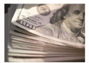
UNCLAIMED FUNDS WITH THE NYS COMPTROLLER From 10am to 12:30pm

Meet the Crime Prevention Officers from the 72<sup>nd</sup> and 78<sup>th</sup> Precincts and hear how you can better safeguard your property and ensure your personal safety and security as warmer weather approaches.