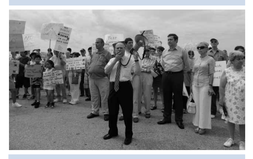
Assemblyman Colton is shown here with neighborhood residents rallying against the proposed garbage transfer station.