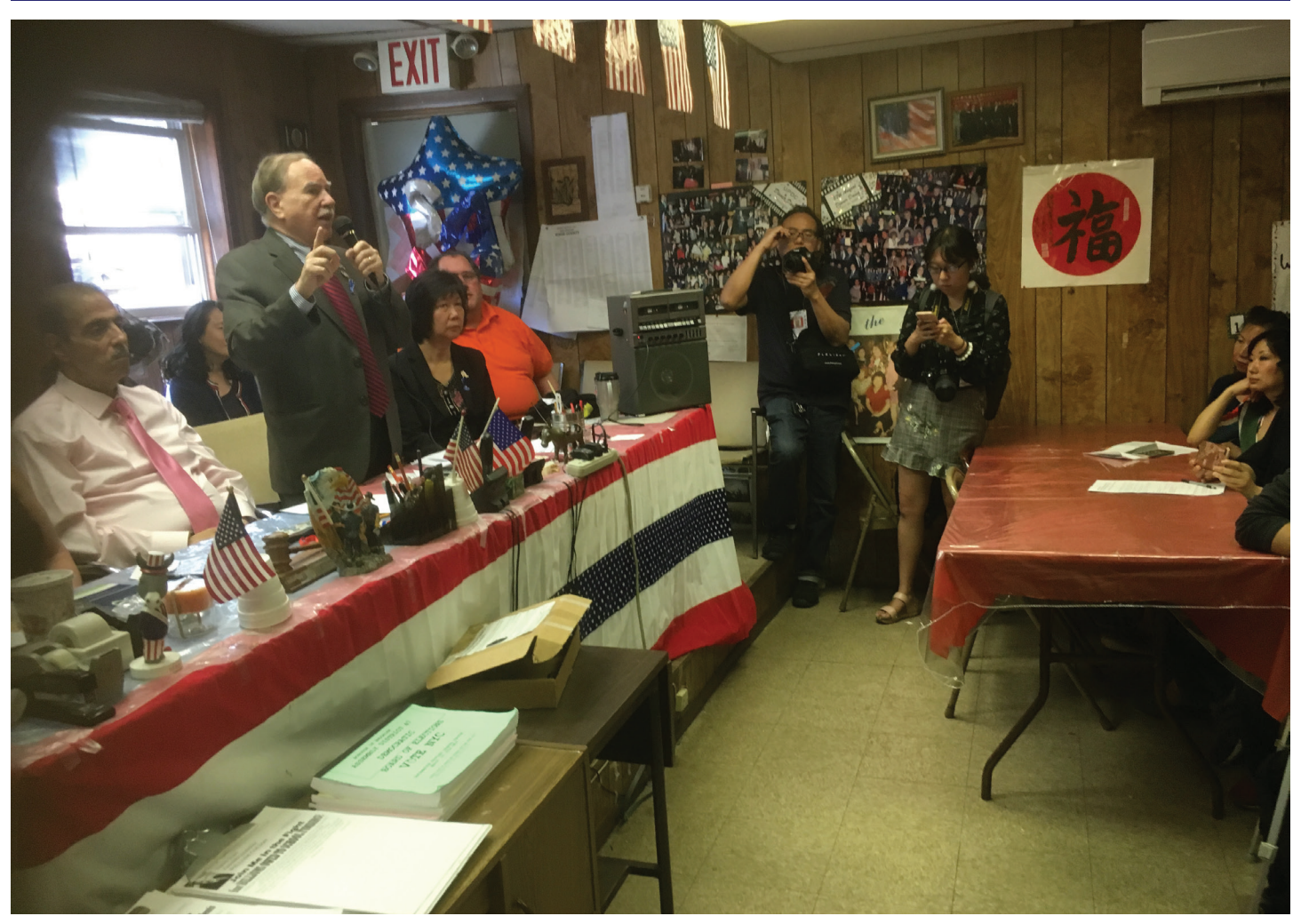
Assemblyman Colton is leading a neighborhood fight against the city plan to eliminate the Specialized High School Admissions Test (SHSAT) as the criteria for admission to the specialized high schools.