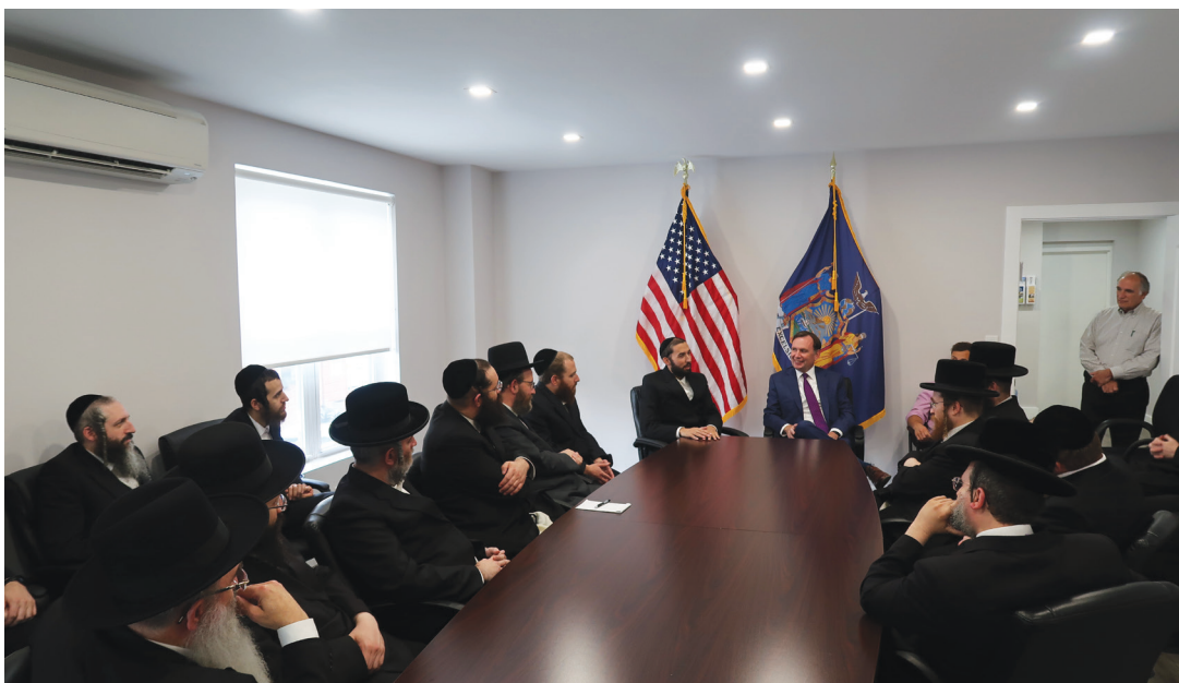
Yeshiva administrators thank Assembly Members Cusick and Eichenstein for ensuring that Staten Island busing is a reality

“I am delighted that we were able to achieve this significant victory for Staten Island parents and their children,” said Assemblyman Simcha Eichenstein. “Like all of New York City’s students, these kids deserve proper school transportation. No child should be denied transportation for the privilege of obtaining an education.”