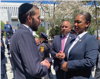
Assemblyman Eichenstein with NYPD Commissioner Keechant L. Sewell following the ceremonies