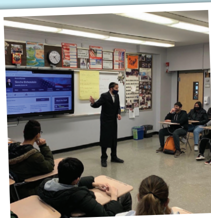
Assemblyman Eichenstein teaches a twelfth grade class at FDR High School about the legislative process in Albany

New York State Assembly, Albany, New York 12248