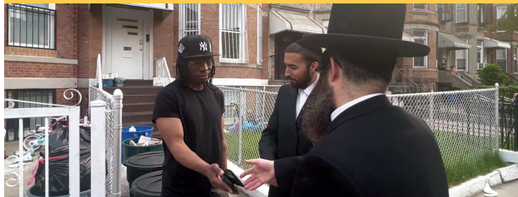
Boro Park resident returns wallet with $1,400 cash to Bronx resident in goodwill gesture