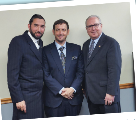
Israel Consul General, Ambassador Asaf Zamir, in Albany to celebrate Israel's 74th Independence with Assemblyman Steven Cymbrowitz and Assemblyman Simcha Eichenstein