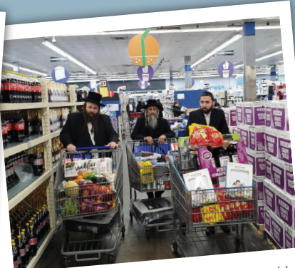
Assemblyman Eichenstein joins with Masbia Relief in resettling Chasidic Ukrainian refugees