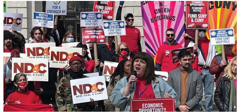
Rallying for a New Deal For CUNY and SUNY at the Capitol (March 23, 2022).

Many people live with their aunts, uncles, nieces or nephews in rental housing, yet our housing law does not consider these relationships as “family” for the purposes of succession rights on residential leases. S691, which is awaiting a number in the Assembly, would grant aunts, uncles, nieces, and nephews the same tenant succession rights enjoyed by other family members in rent-regulated housing.