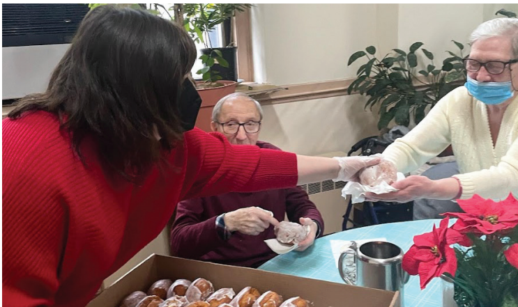
Delivering freshly-baked paczki to our elders on Fat Thursday at the Pete McGuinness Senior Center (February 24, 2022).

A8457, the idea for which was brought to us by a constituent, would ensure that adjunct professors do not have their hours of labor under-