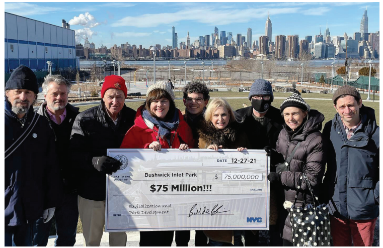
Celebrating $75 million in new funding for the completion of Bushwick Inlet Park (February 6, 2022).