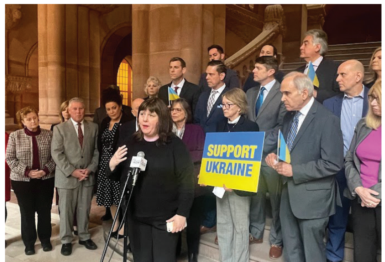
Standing with fellow legislators at the Capitol in solidarity with the people of Ukraine (March 24, 2022).