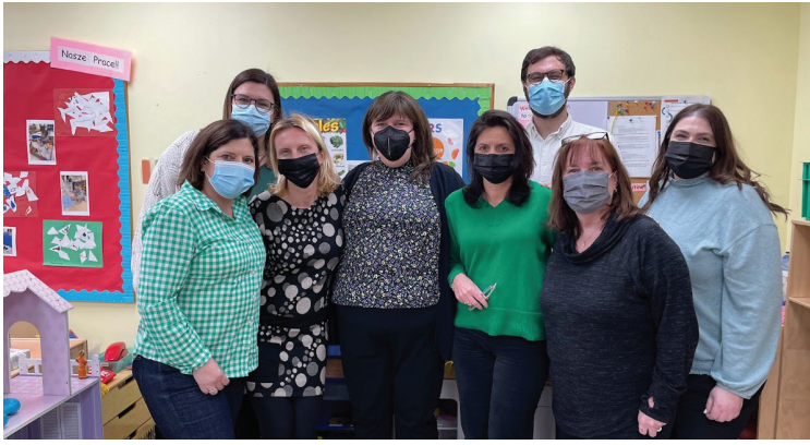
Visiting the wonderful staff at Williamsburg Y Head Start (March 4, 2022).