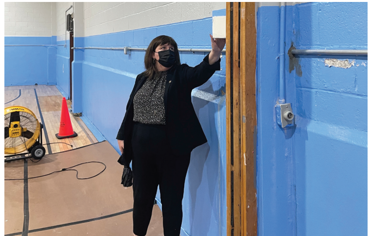
Inspecting the damaged basketball court at Taylor-Wythe Houses in Williamsburg. Repairs will be completed soon! (October 12, 2021).

As the human rights violations, violence, and constitutional abuses continue at Rikers Island, I have advocated for an overhaul of the state correctional oversight body, the State Commission of Correction, which has abdicated its statutory oversight duties. A8497 reforms the membership of the SCOC, increases its public reporting requirements and the frequency of its inspections, and strengthens its disciplinary powers.