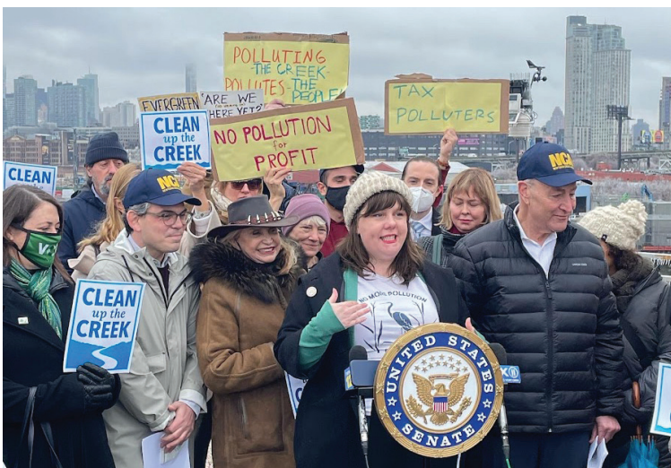
On the roof of Greenpoint's Kingsland Wildflowers, calling on the EPA to accelerate the clean up of Newtown Creek (March 1, 2022).